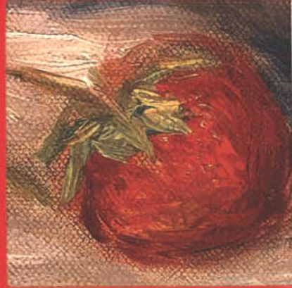
A red strawberry